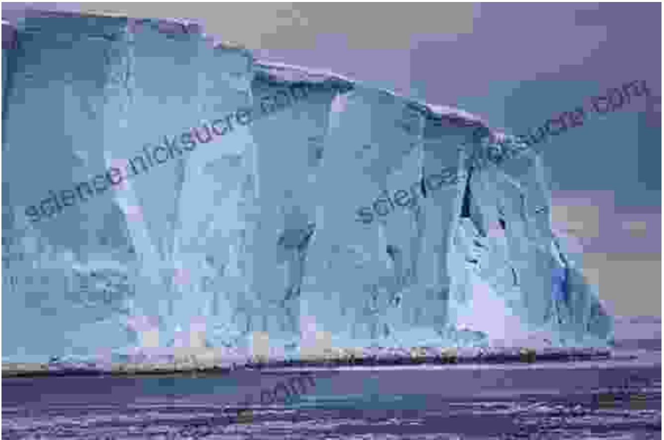
The colossal ice cliffs of the Ross Ice Shelf, towering majestically in the Antarctic wilderness

Her camera lens became a conduit through which she showcased the breathtaking diversity of Antarctica's landscapes. From the towering ice cliffs of the Ross Ice Shelf to the ethereal blue icebergs floating in the Weddell Sea, each composition was a testament to the raw and untamed beauty of this frozen realm.