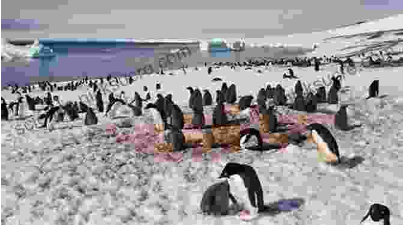
A group of playful Adelie penguins enjoying a sledding adventure, showcasing their agility and adaptability to the Antarctic ice